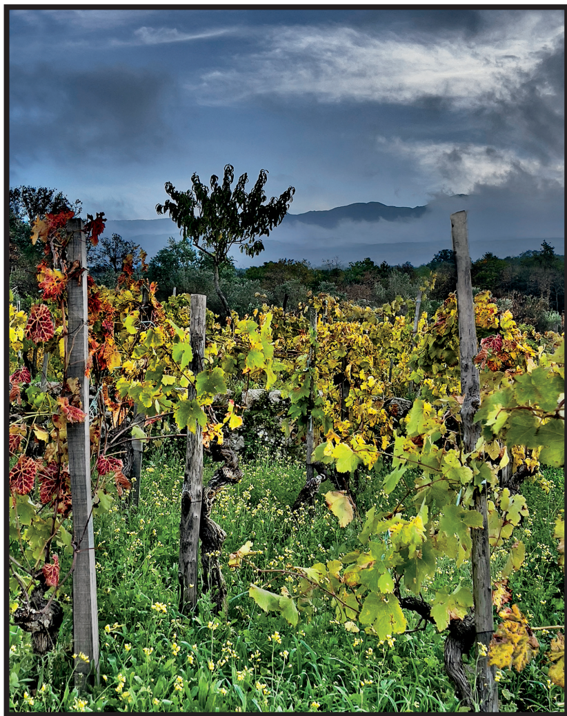
Etna emerges from the clouds at Masseria del Pino