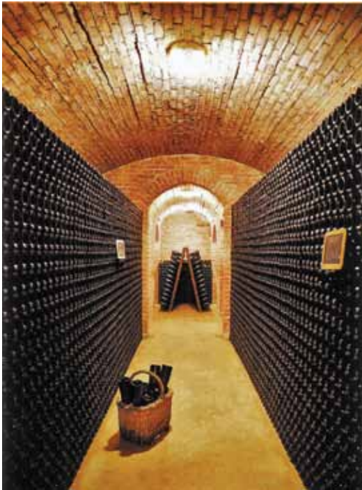
Champagne J. Lassalle's cellar in Chigny-les-Roses

H ERE IN BERKELEY, we do things our way. Instead of offering you discounted prices on Champagne after the holiday party season is over, we'll do it now . Our reasoning is simple: Who minds saving a few bucks before the holidays? While those of us in the wine biz are likely to make any day an occasion for a glass of Champagne, normal folks tend to drink more of it around the next two months than any other time of the year. Well, okay. Happy to oblige. Our only advice: stock up now before our prices go back up in December. Please permit us a little more grandstanding . . . We have been selling artisan-made Champagne since the 1970s—long before anyone knew what “Grower Champagne” was. We currently import three superstar domaines (with a fourth on the way). Dive in to see which ones are right up your alley.