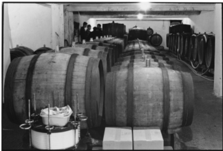
Blending at Château d'Epiré