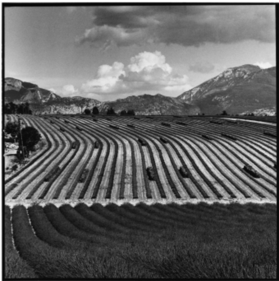
Lavender Harvest, Provence