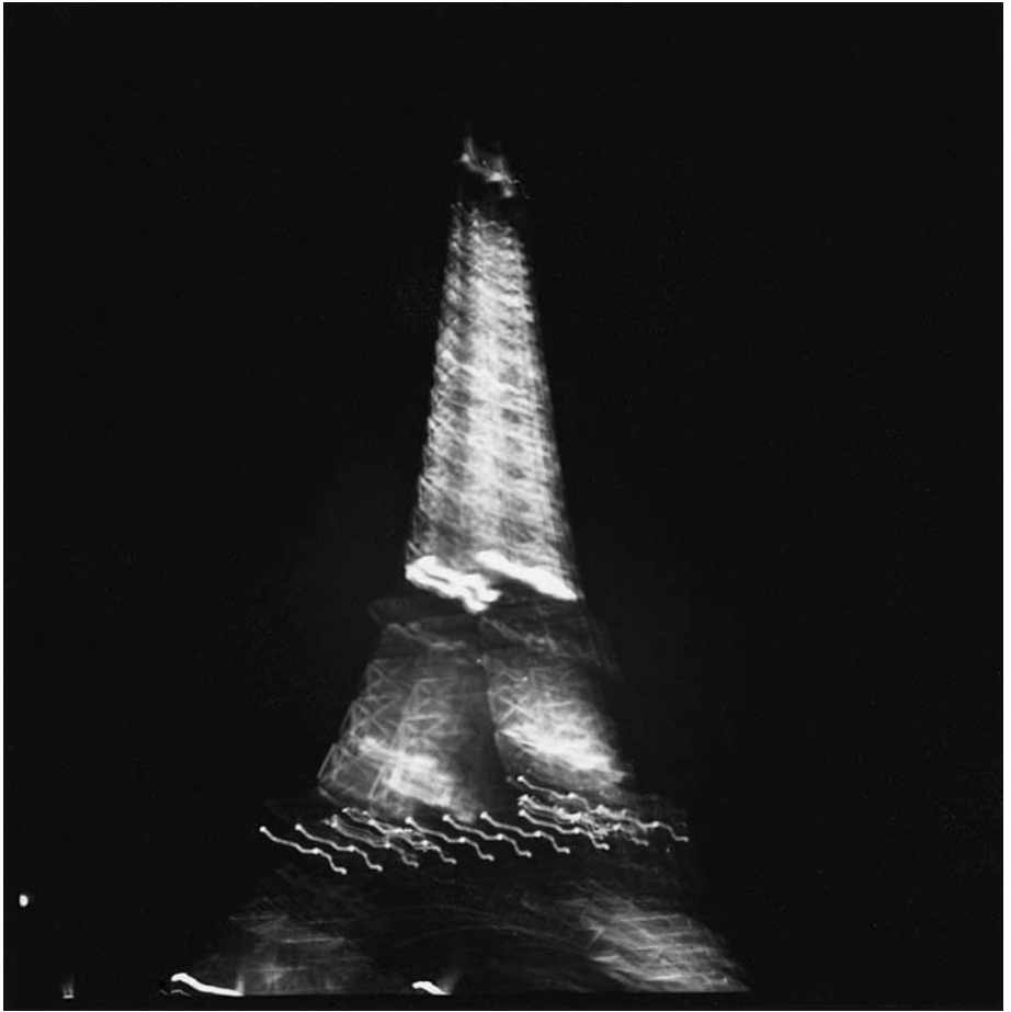
Eiffel Tower by night