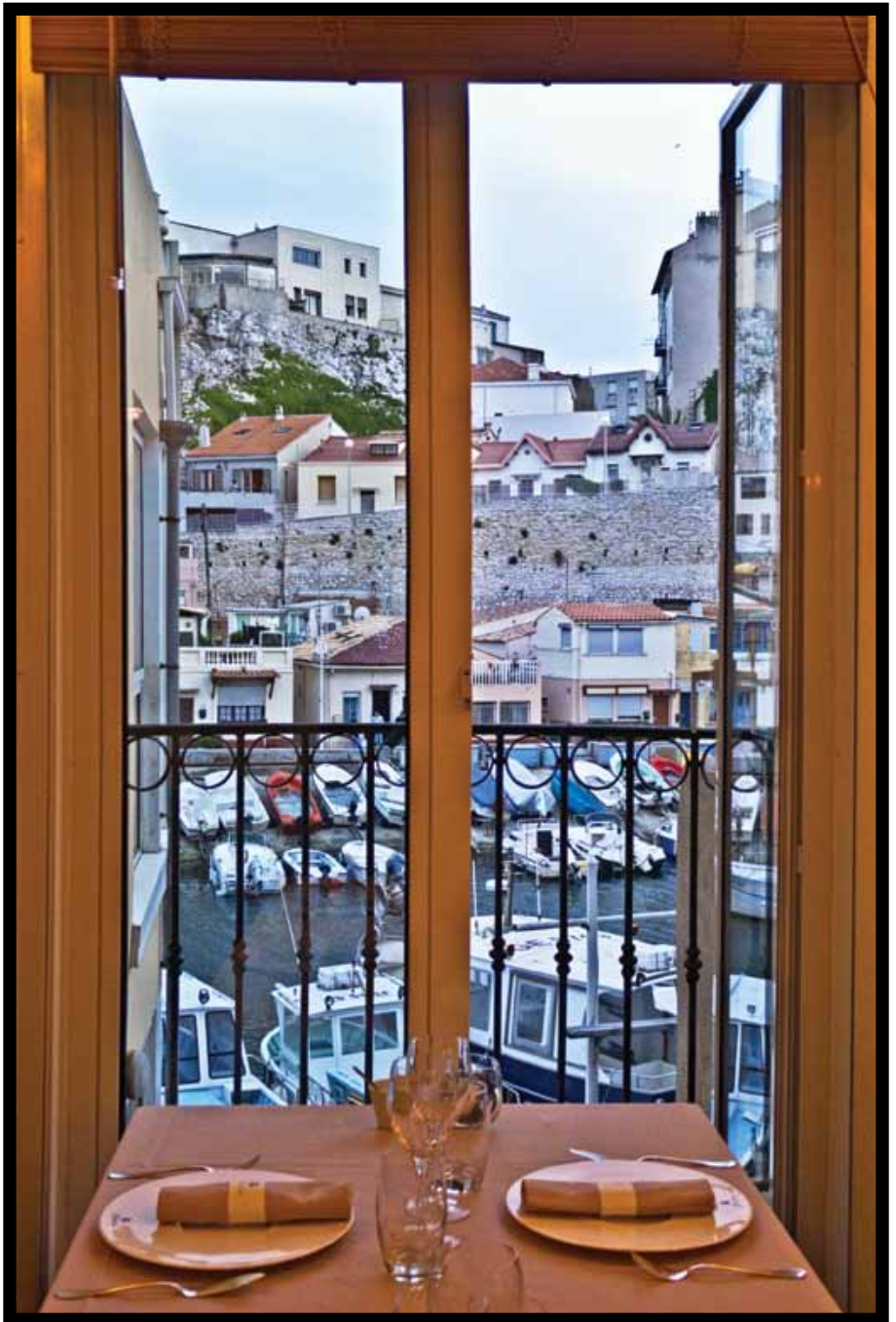
Chez Fon Fon