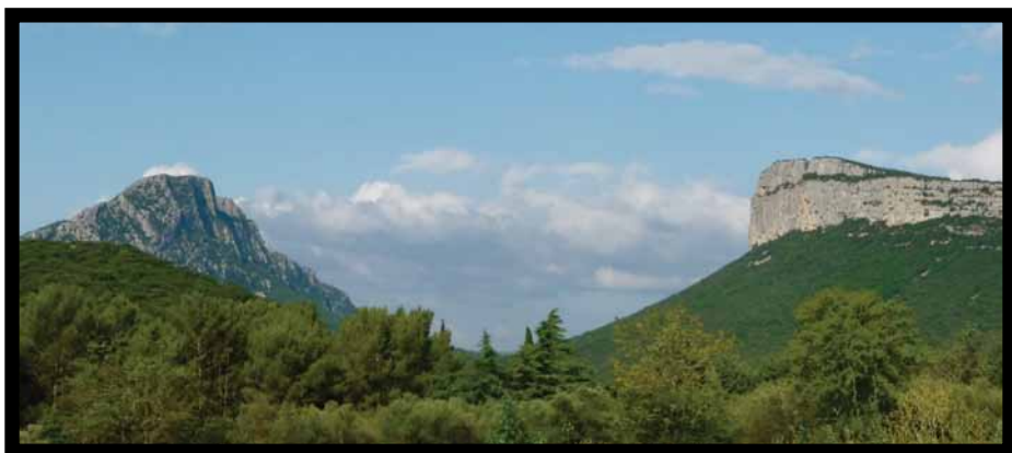
Pic Saint Loup: where that wild Ravaille magic happens