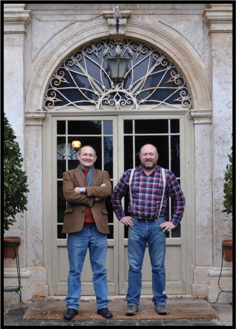
The Bandinelli brothers of Villa di Geggiano