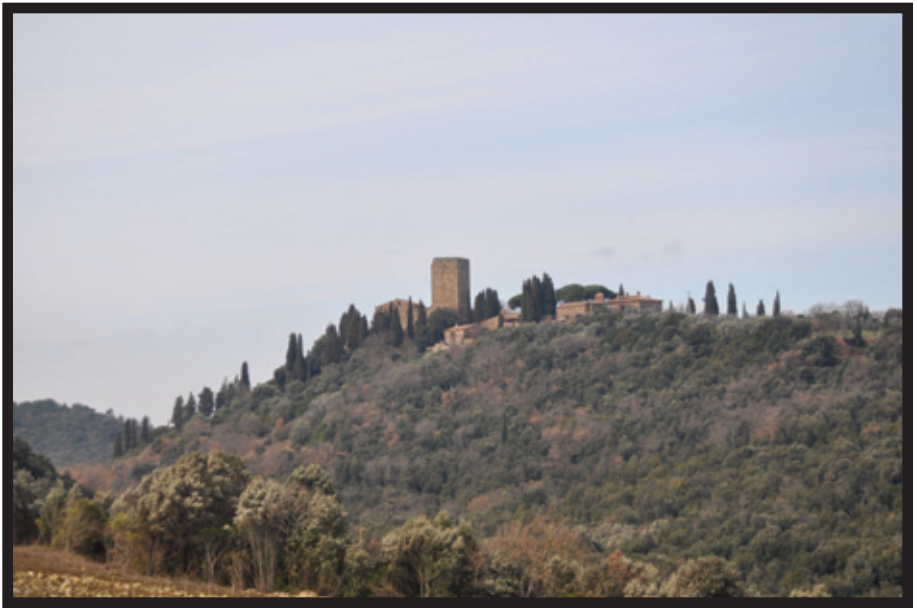
The grounds of Sesti