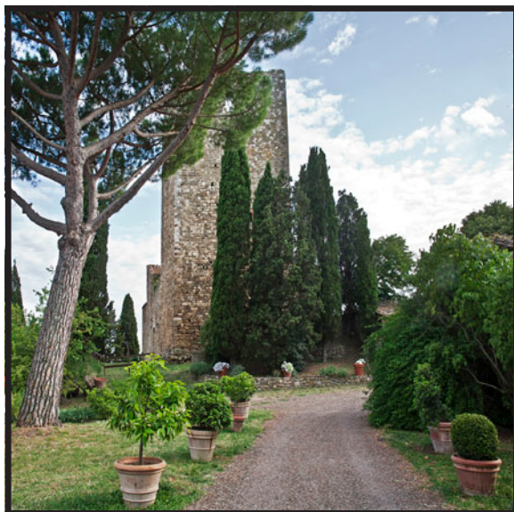
The grounds of Sesti